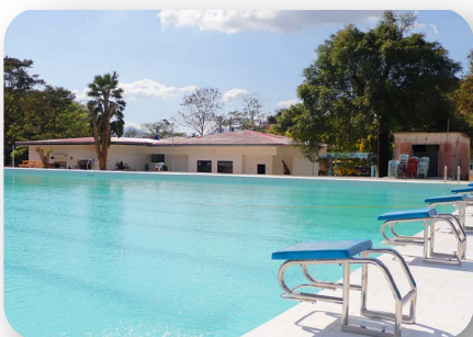
Olympic Size Swimming Pool