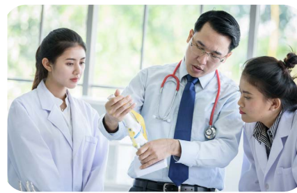
Ideal Professor Student Ratio For Better Learning