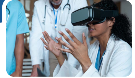
3D Anatomage & Virtual Reality Anatomy