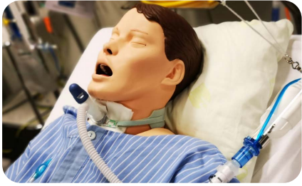
Simulation Mannequins for Enhanced Practical Learning